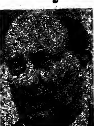
Sir Walker progresses in components talks

British industry has responded to a challenge from the nuclear power programme to take orders worth millions of pounds from foreign companies which were originally in line to supply equipment for the Sizewell nuclear power station in Suffolk.